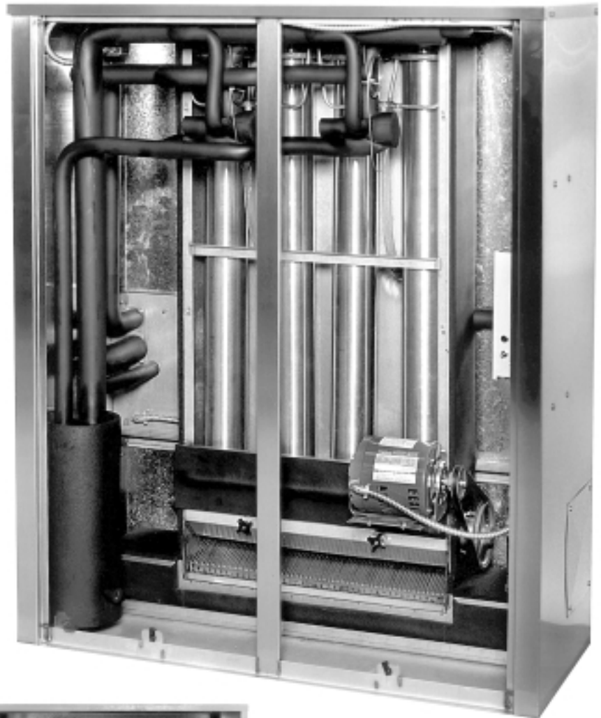
Shown with EZ lift panels removed